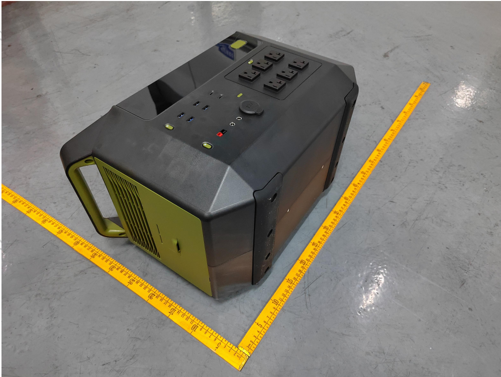
Figure 1 Overall view I of battery