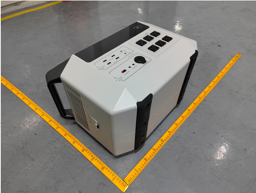
Figure 3 Overall view III of battery