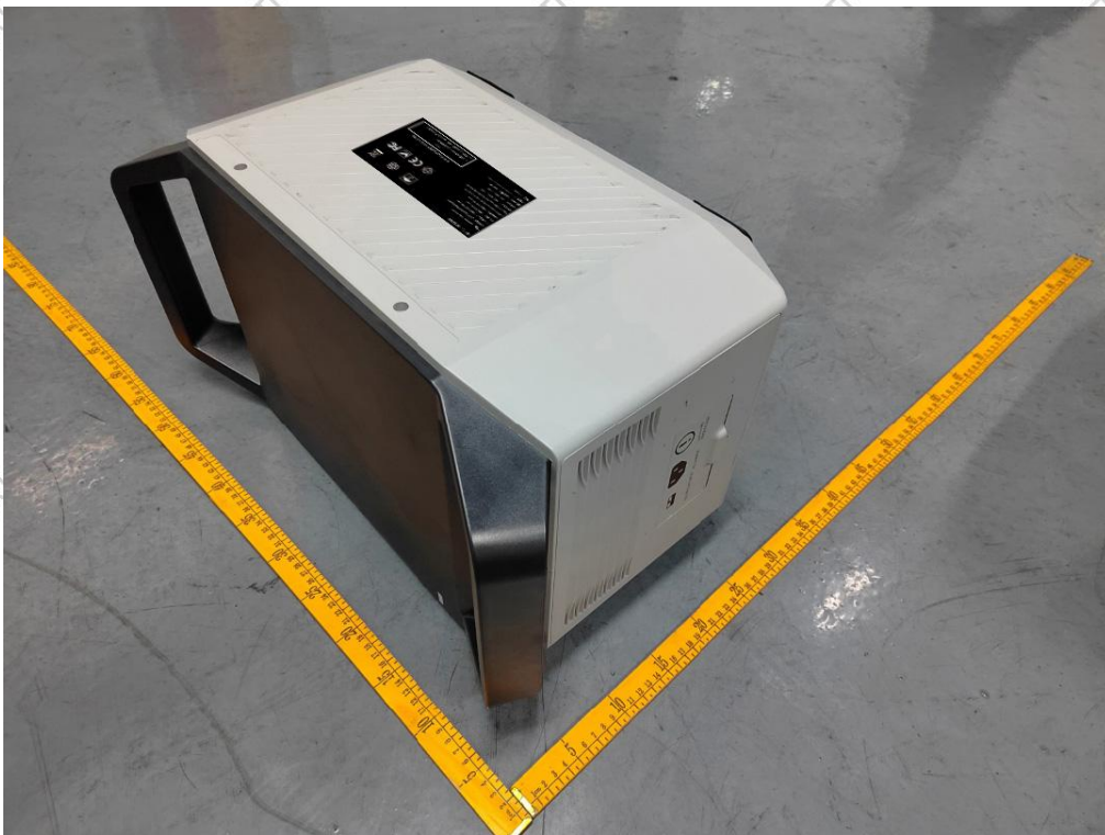
Figure 4 Overall view IV of battery