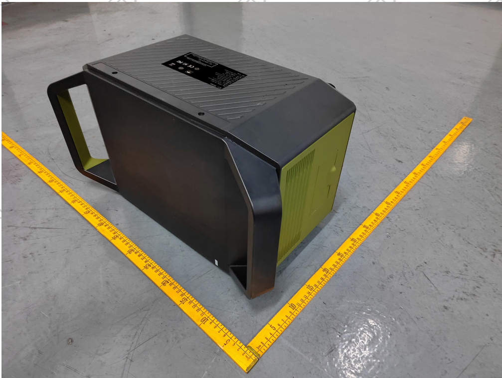
Figure 2 Overall view II of battery